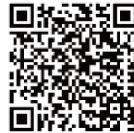
Alternative Drive Control Videos