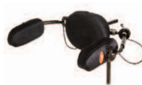
Switch-It Dual Pro™ Proportional Head Array