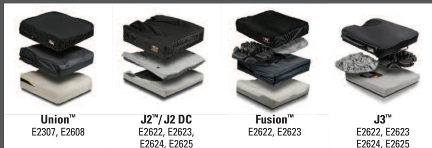
Union™ E2307, E2608