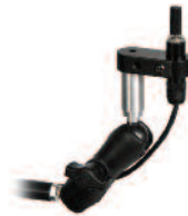
Switch-It Micro Pilot