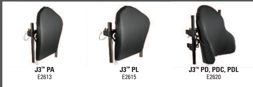
J3™ PA E2613