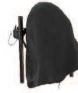
J3™ PD, PDL & PDC E2620