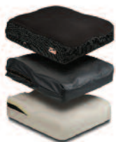
Union™ E2607, E2608