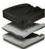
J2™ Deep Contour E2622, E2623, E2624, E2625