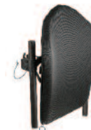
J3™ PL E2615