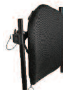
J3™ PA E2613, E2614