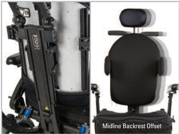
Midline Backrest Offset