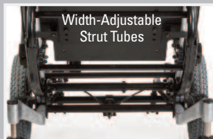
Width-Adjustable Strut Tubes

Caregiver Aids: angle adjustable stroller handle, foot release tilt actuator, and hands-free attendant wheel lock