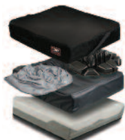
Fusion™ E2622, E2623