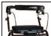
Legacy Deluxe with padded seat and backrest