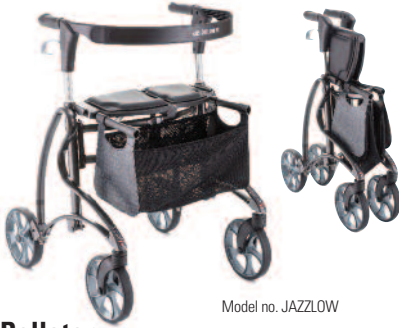
Model no. JAZZLOW