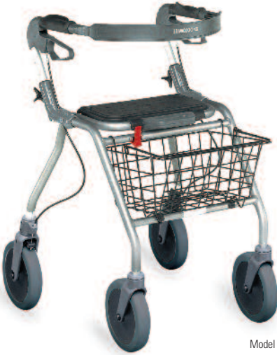
Model no. 12160