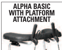
ALPHA BASIC WITH PLATFORM ATTACHMENT