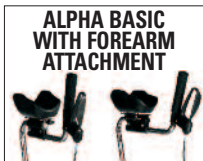
ALPHA BASIC WITH FOREARM ATTACHMENT