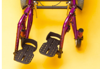
LEAF in Windswept Right