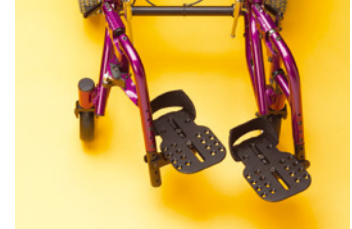
LEAF in Windswept Left