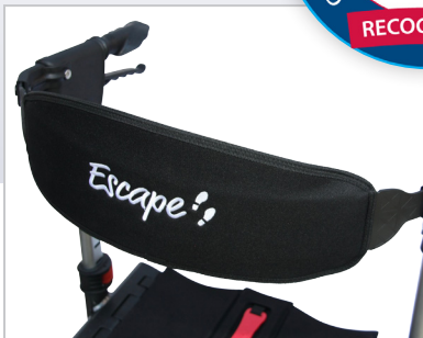
Large adjustable padded backrest