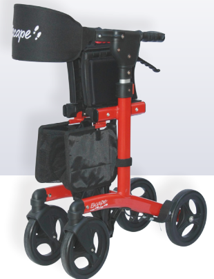
Spring-assist Folding Folds with a single lift of the seat handle.