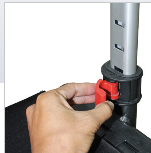
Easy to adjust handle height