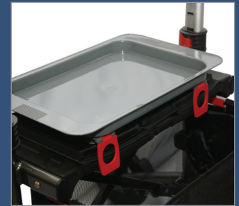
Plastic Tray 500-4300