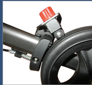
Slow Down Brake 500-4000