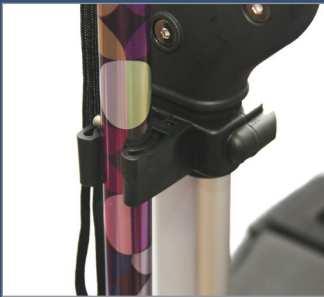
Cane Holder (cane not included) 500-4100

Escape offers a variety of high-quality accessories that help enhance the rollator comfort and performance. These can be purchased separately.