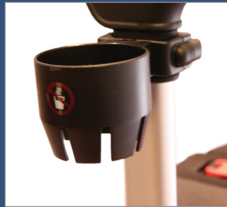
Cup Holder 500-4200