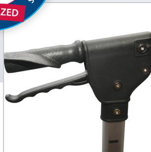
Anatomical handles and Cable-free braking system