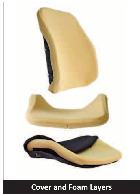
Cover and Foam Layers