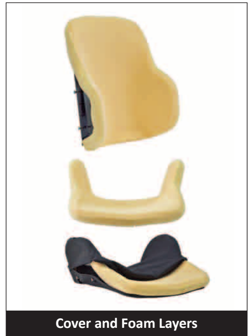
Cover and Foam Layers