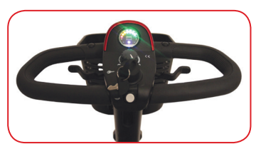
Wraparound Delta Tiller

The Go-Go ® Sport delivers high-performance and convenience on the go. With a 325 lb. weight capacity, a charger port in the tiller, standard front LED lighting and a maximum speed up to 4.7 mph., the Go-Go ® Sport is feature rich and travel ready.