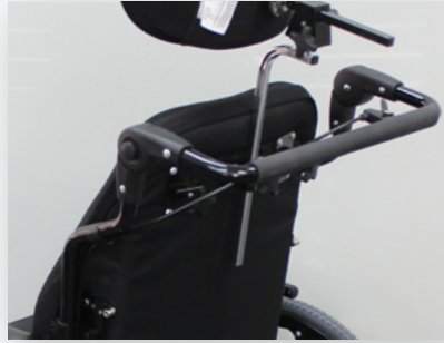
Standard Angle Adjustable Stroller Handles