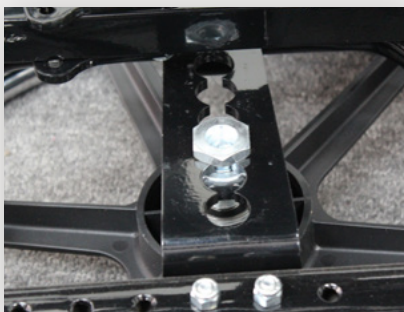
Seat To Floor Height Adjustability