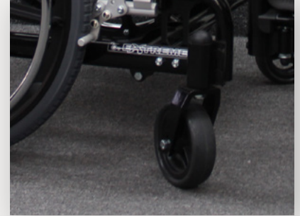
Angle Adjustable Front Journals