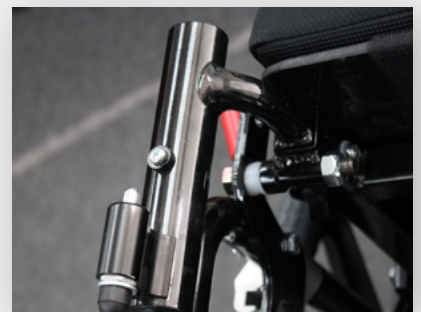
Offset Front Hangers (Optional)