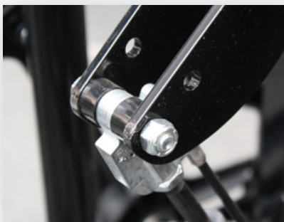
Zero Maintenance Soft Set Cylinders