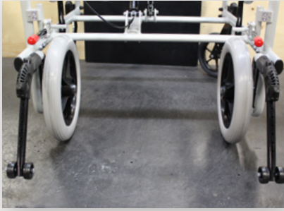
Narrow Configuration (Inside Wheel Mount)