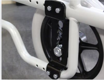
Rear Axle Adjustability