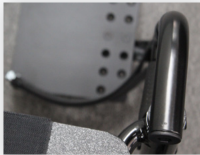
Center Pivot Swing In And Swing Out Front Rigging