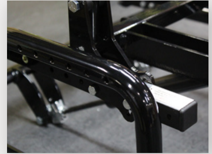
Rear Depth Adjustable Frame