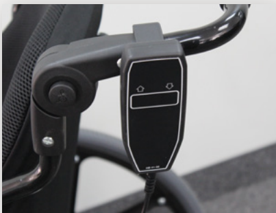
Power Tilt Option